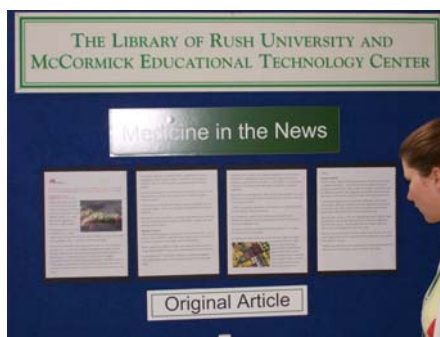
The popular Medicine in the News kiosk will now be available electronically.

interested in the Medicine In the News kiosk, but who are unavailable to visit the Library in person. Interested Library users will receive a weekly email including a web link to a popular medical article along with the path to the scholarly article that is provided via the Library's electronic journal collection. Because of licensing agreements, this service will only be available to direct Rush affiliates.