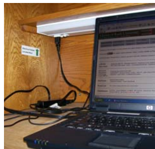
New carrel fixtures provide an easy power source.

Electrical outlets are also in the process of being installed on the walls by the study tables on either side of the journal collection.