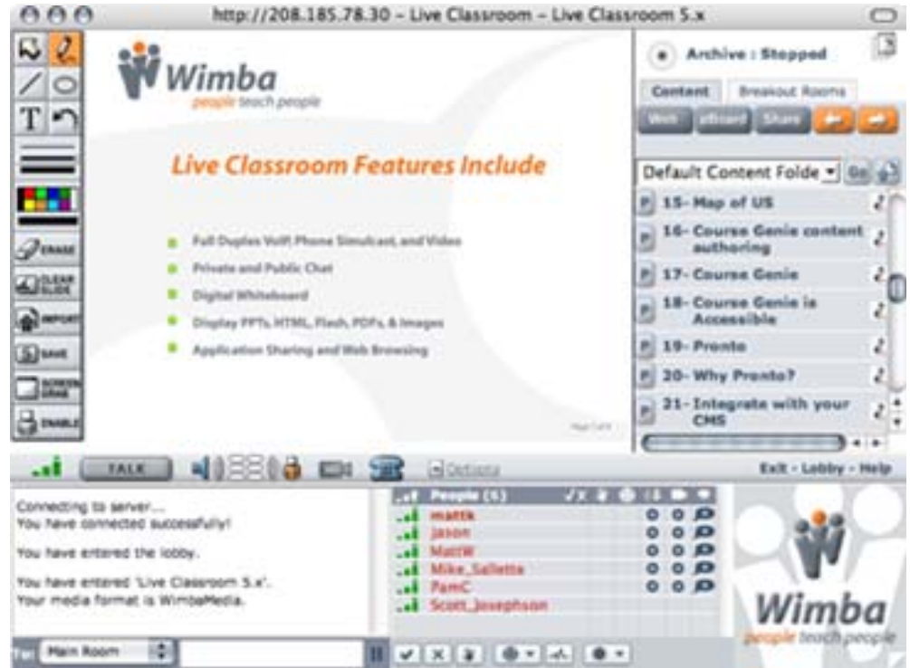
Wimba's Live Classroom instructor view screenshot.