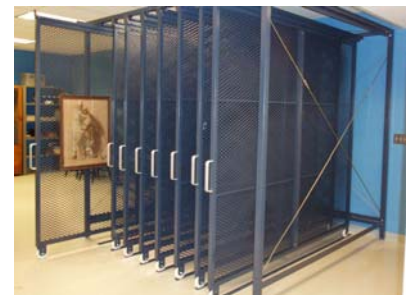
New Archives storage system safely holds paintings.